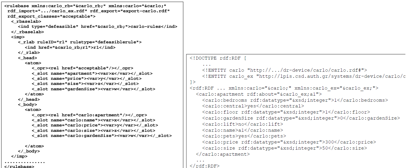
Figure 1. (a) Rule base fragment, written in the RuleML-like syntax of DR-DEVICE, and (b) Sample of RDF document displaying available apartments

So, he delegates the transaction to his agent that sends Carlo's requirements to a broker in order to get back all the available houses with the proper properties. These requirements are expressed in defeasible logic, in a RuleML-like syntax. A fragment of the rule base is displayed in Figure 1 (a).